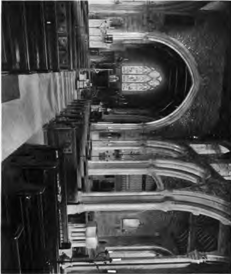
INTERIOR VIEW OF THE CHURCH OF ST. GREGORY, AT BECKINGTON, CO. SOMERSET, ENGLAND